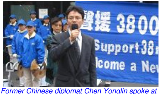
ormer Chinese diplomat Chen Yonglin spoke a the rally

(Clearwisdom.net) The "Quit the CCP" Service Center of Sydney, Australia, organized a rally and a Great-Wall-of-Truth in Sydney's Chinatown on June 14, 2008. The events were to support the 38 million Chinese people that have withdrawn from the Chinese Communist Party (CCP) and its affiliated organizations. The rally also exposed and condemned the CCP for directing its overseas Chinese organizations to hire thugs to surround the Quit the CCP Service Center in Flushing, New York, and attack volunteer workers and Falun Gong practitioners at the service center.