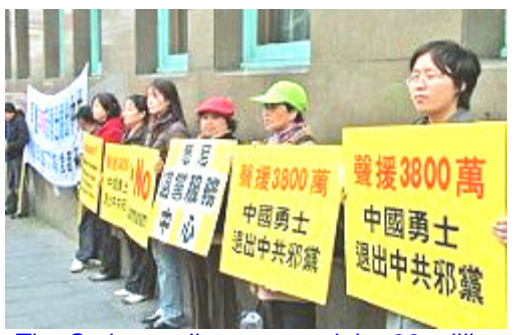
The Sydney rally supported the 38 million Chinese that have withdrawn from the CCP.